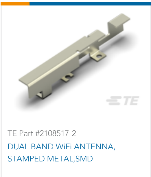
TE Part #2108517-2 DUAL BAND WiFi ANTENNA, STAMPED METAL,SMD