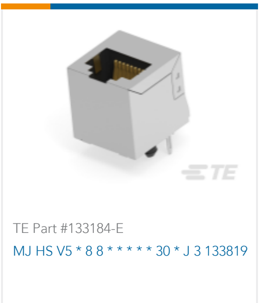
TE Part #133184-E MJ HS V5 * 8 8 * * * * 30 * J 3 133819