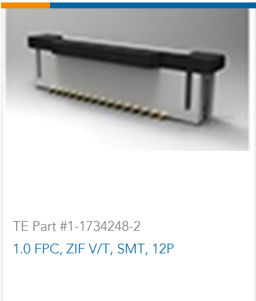
TE Part #1-1734248-2 1.0 FPC, ZIF V/T, SMT, 12P