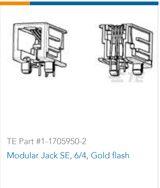
TE Part #1-1705950-2 Modular Jack SE, 6/4, Gold flash