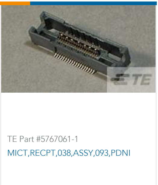
TE Part #5767061-1 MICT,RECPT,038,ASSY,093,PDNI