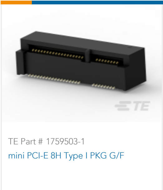
TE Part # 1759503-1 mini PCI-E 8H Type I PKG G/F