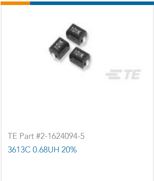
TE Part #2-1624094-5 3613C 0.68UH 20%