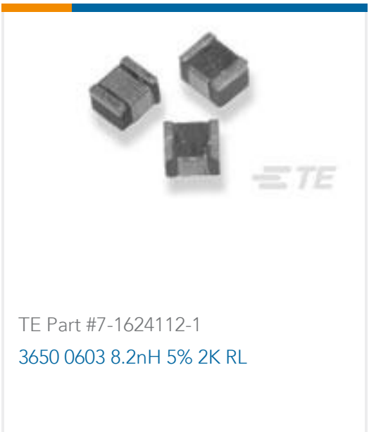
TE Part #7-1624112-1 3650 0603 8.2nH 5% 2K RL