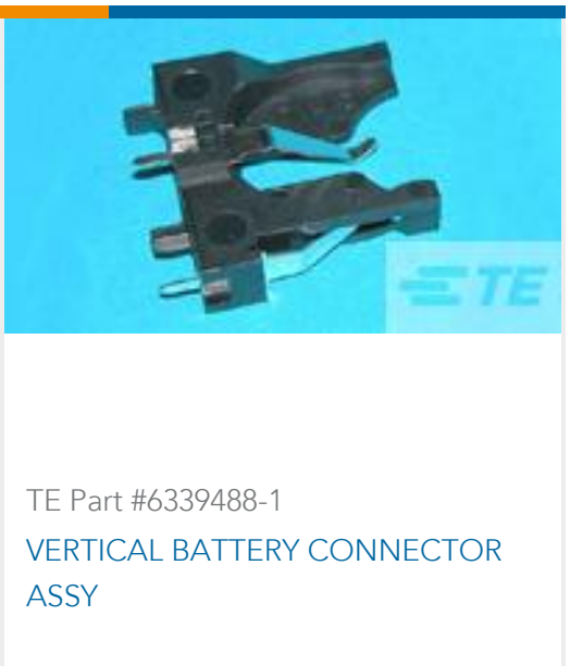
TE Part #6339488-1 VERTICAL BATTERY CONNECTOR ASSY