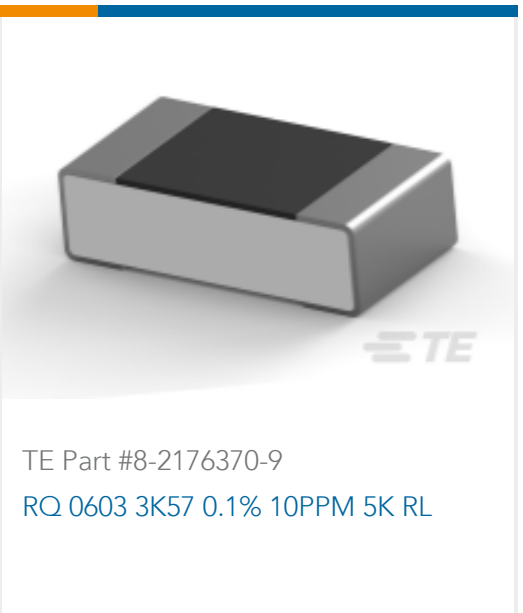
TE Part #8-2176370-9 RQ 0603 3K57 0.1% 10PPM 5K RL